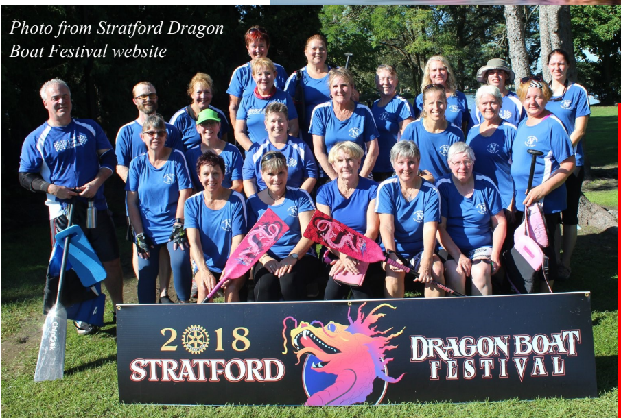
Photo from Stratford Dragon Boat Festival website