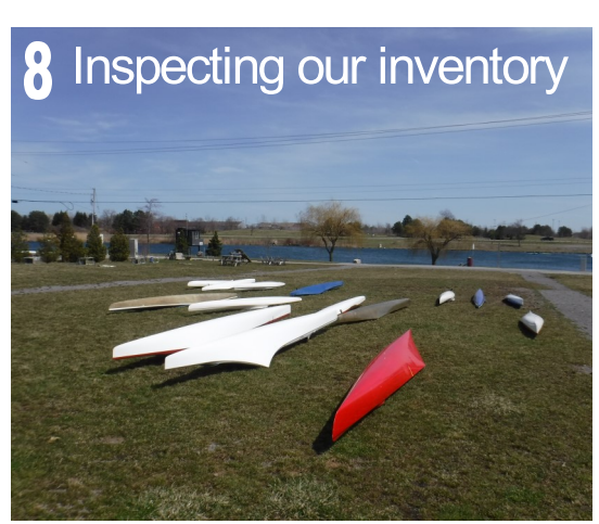
The Catch Newsletter, Vol 9, No. 4 May 2019 Page 2 of 4