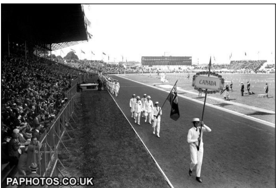
The Canadian delegation at the 1924 Paris Olympics. Note the Canadian flag is not yet the familiar red maple leaf.