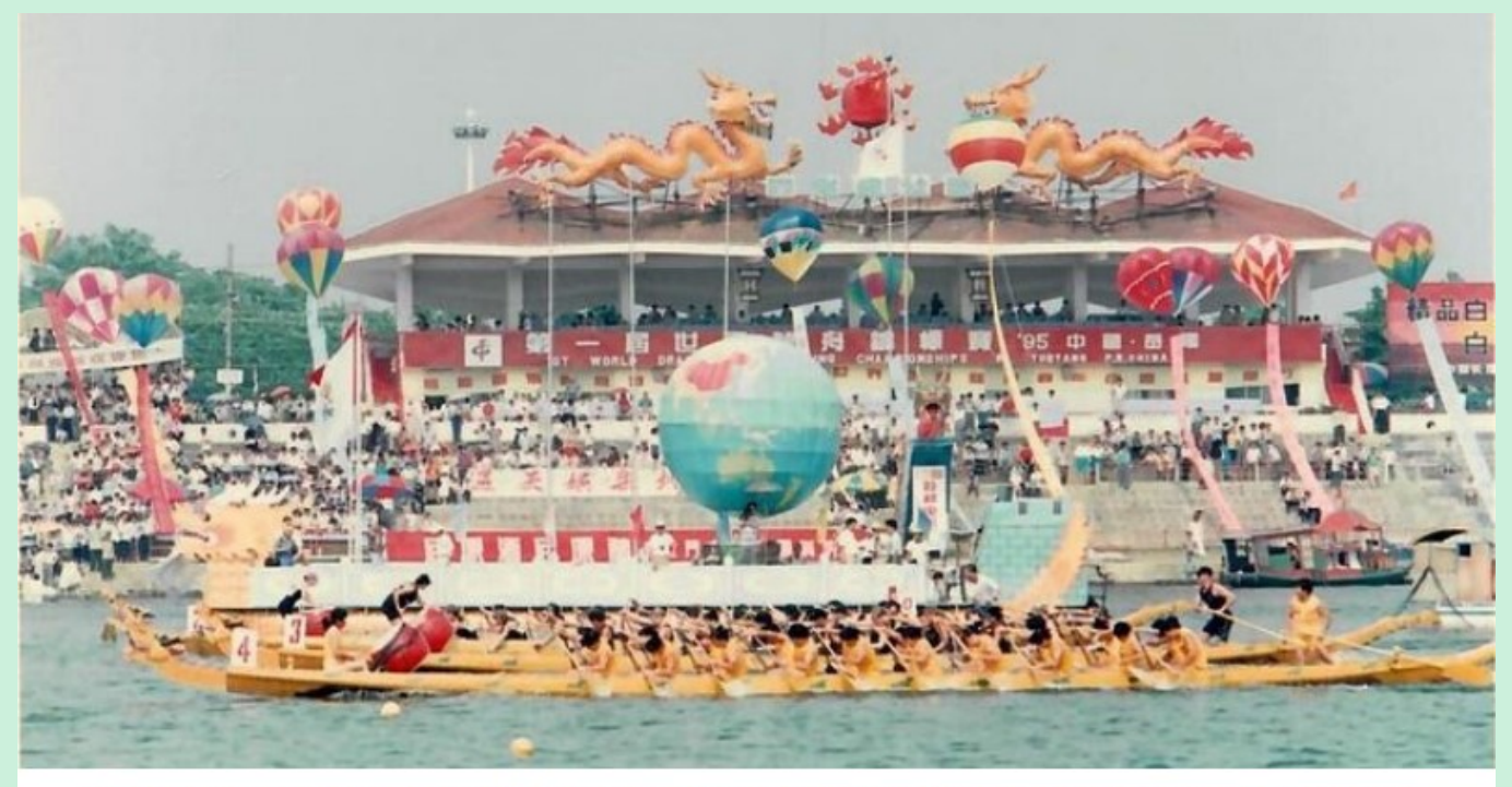
Cover photo: Opening Ceremony at the 1995 1st IDBF World Dragon Boat Championships, Yueyang, China.

Longzhou is Mandarin for Dragon Boat. This newsletter can be found on the International Dragon Boat Federation website, dragonboat.sport. The <u>June 2020 edition</u> was a celebration of the 25th anniversary of the first International Dragon Boat Federation Championships in Yueyang, China.