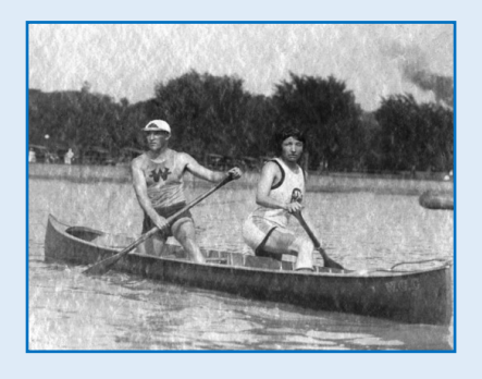
In 1995, Canada was the first country to include women-in-canoe at its Nationals Posted August 13, 2018