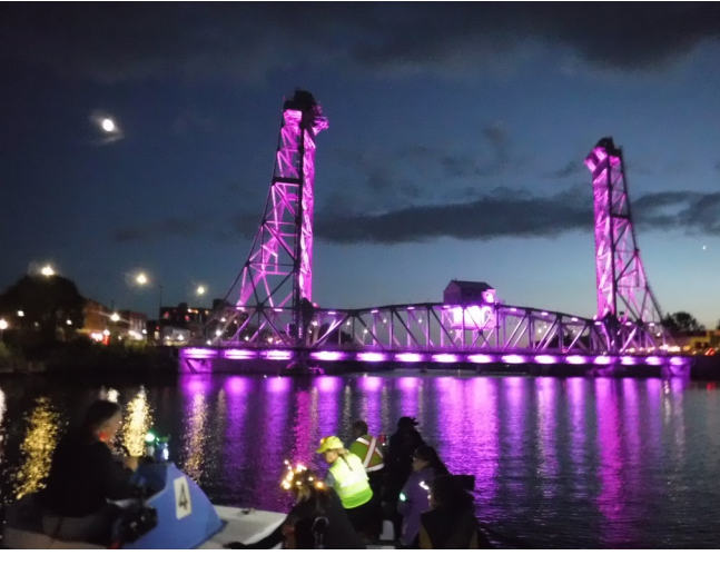
The Catch Newsletter, Vol 11, No. 10 November 2021 Page 3 of 6