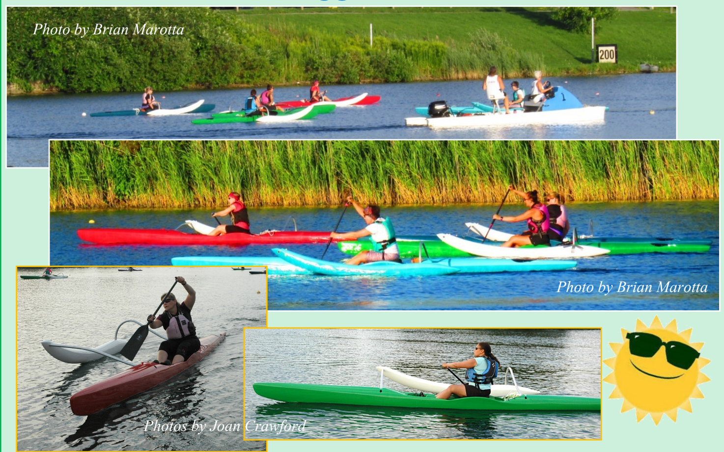
The Catch Newsletter, Vol 11, No. 8 September 2021 Page 3 of 8