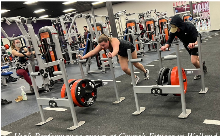
High Performance group at Crunch Fitness in Welland.

While it's not the same as training in California, SNCC athletes are still working hard.