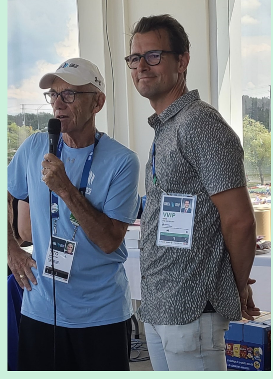
Photo by Alan Wright as he volunteers in the Timing Tower for Canoe/Kayak with VIP Adam van Koeverden, Canada Summer Games athlete 1997, Canadian Olympian in Canoe/Kayak Sprint (Athens 2004, Beijing 2008, London 2012, Rio de Janeiro 2016), Toronto PanAm Games 2015.